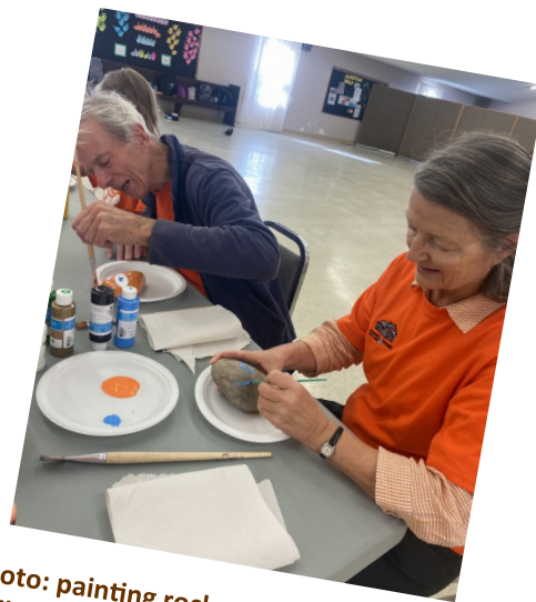
Photo: painting rocks at Orange Shirt Day Children's program at Immanuel church, in memory of the children.

http://www.newenglandcompany.org/default.htm